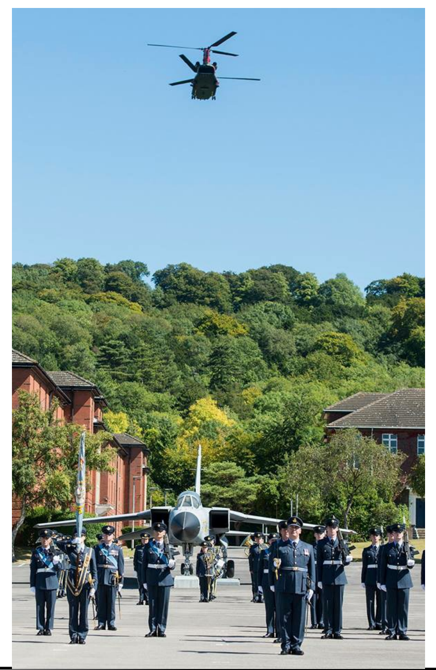
RAFAGEN is the official newsletter of the Letchworth Hitchin & District branch of The Royal Air Forces Association